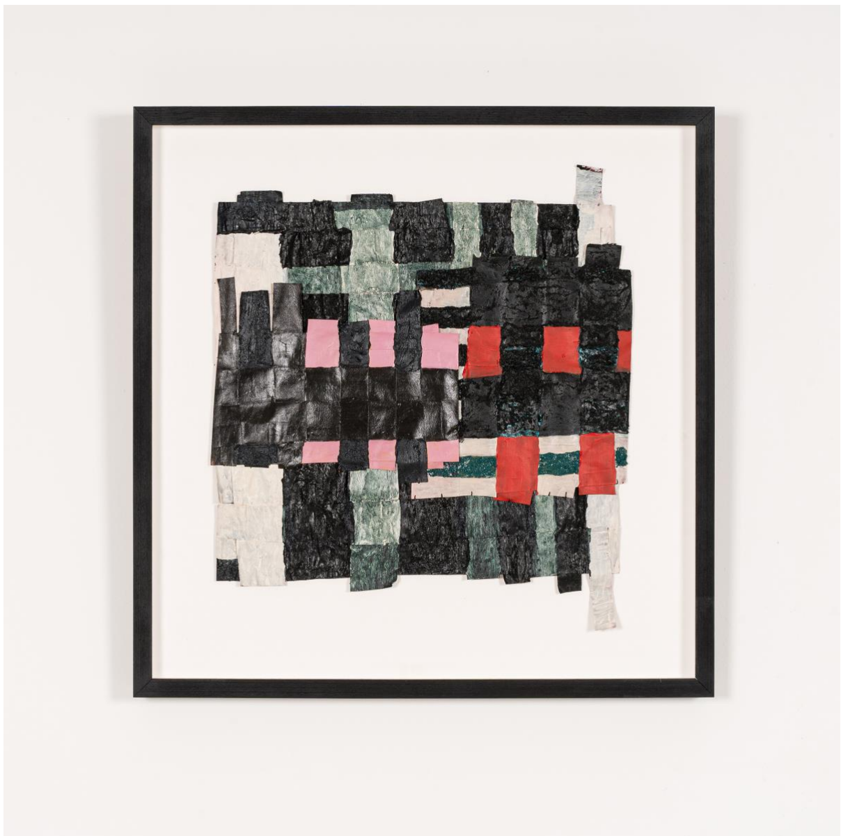
Egle Jauncems Untitled, 2021 Acrylic on paper 59 x 58 cm