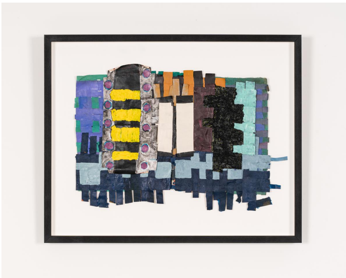
Egle Jauncems Untitled, 2021 Acrylic on paper 55 x 67,5 cm